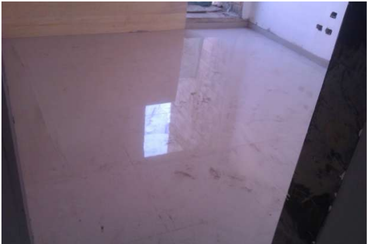
Progress of works in BLOCK A

They are not necessarily demonstrating all activities of works that were carried out during the period of the report.