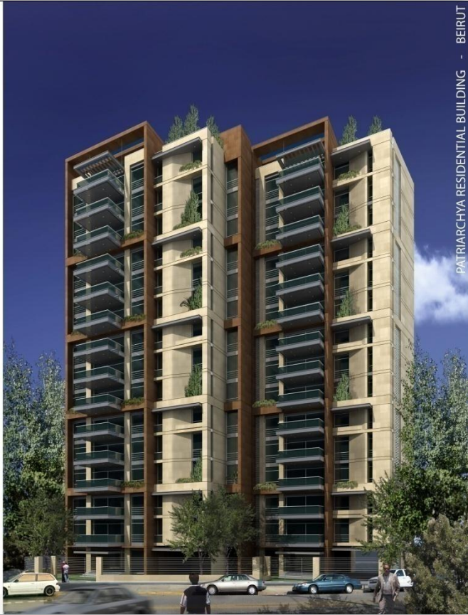
PATRIARCHYA RESIDENTIAL BUILDING - BEIRUT