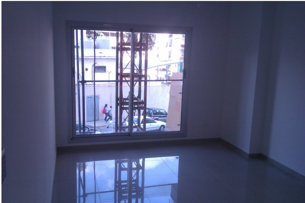
Work progress in the 1 st floor / mockup apartment

They are not necessarily demonstrating all activities of works that were carried out during the period of the report.