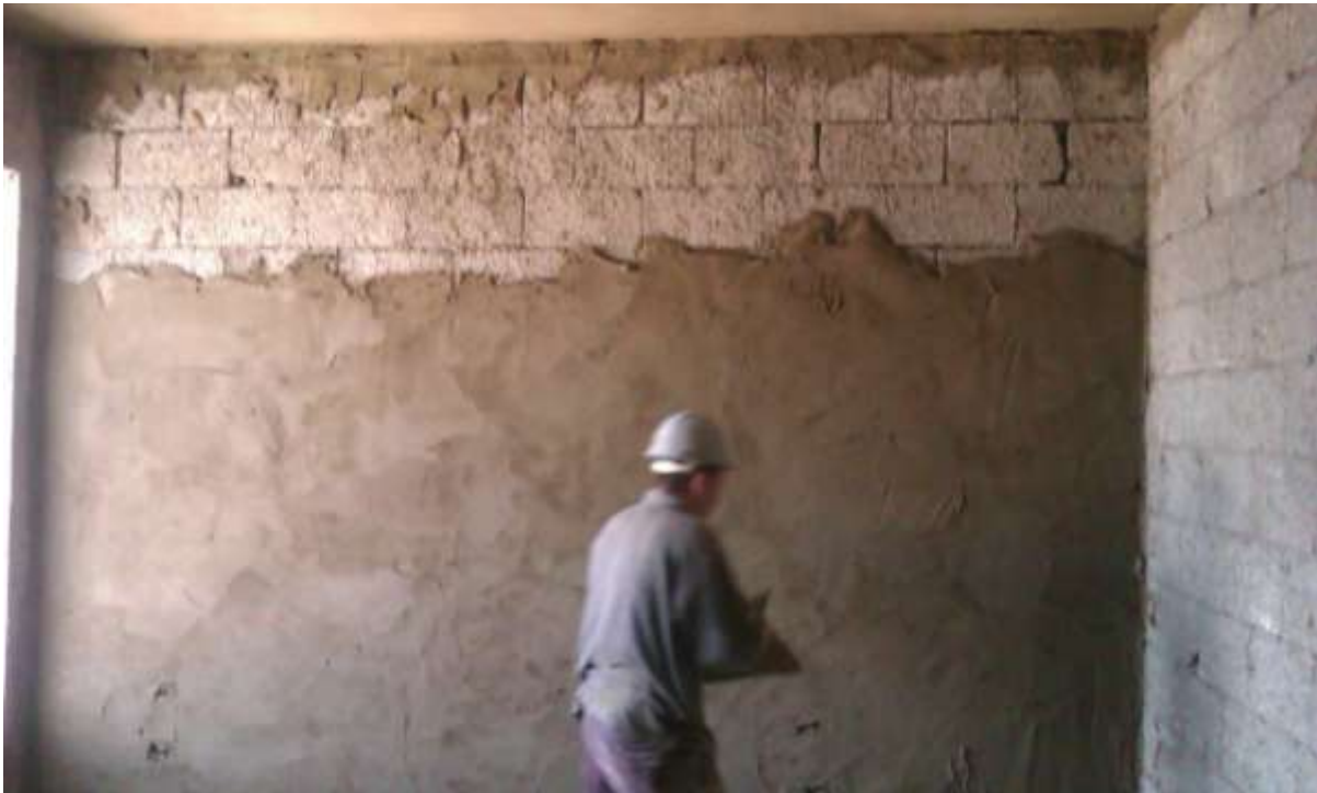
Progress of works on the 12 th floor