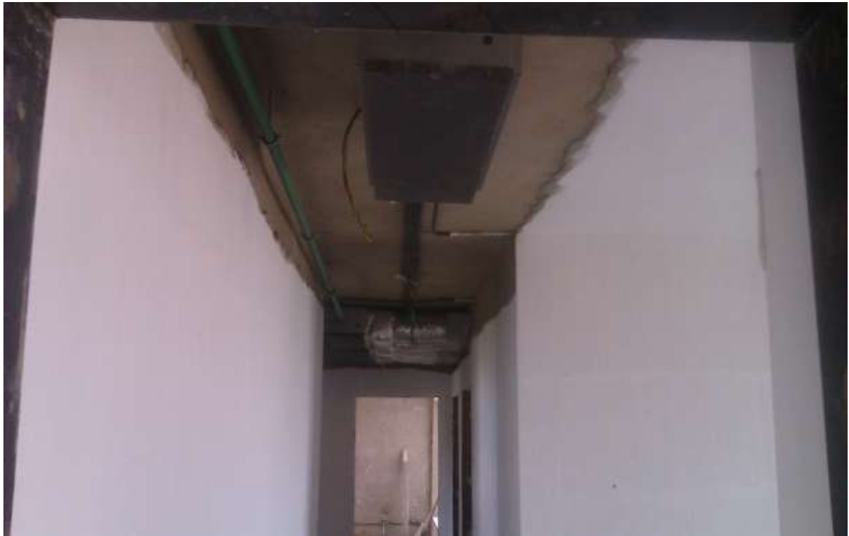
Progress of works on the 6 th floor