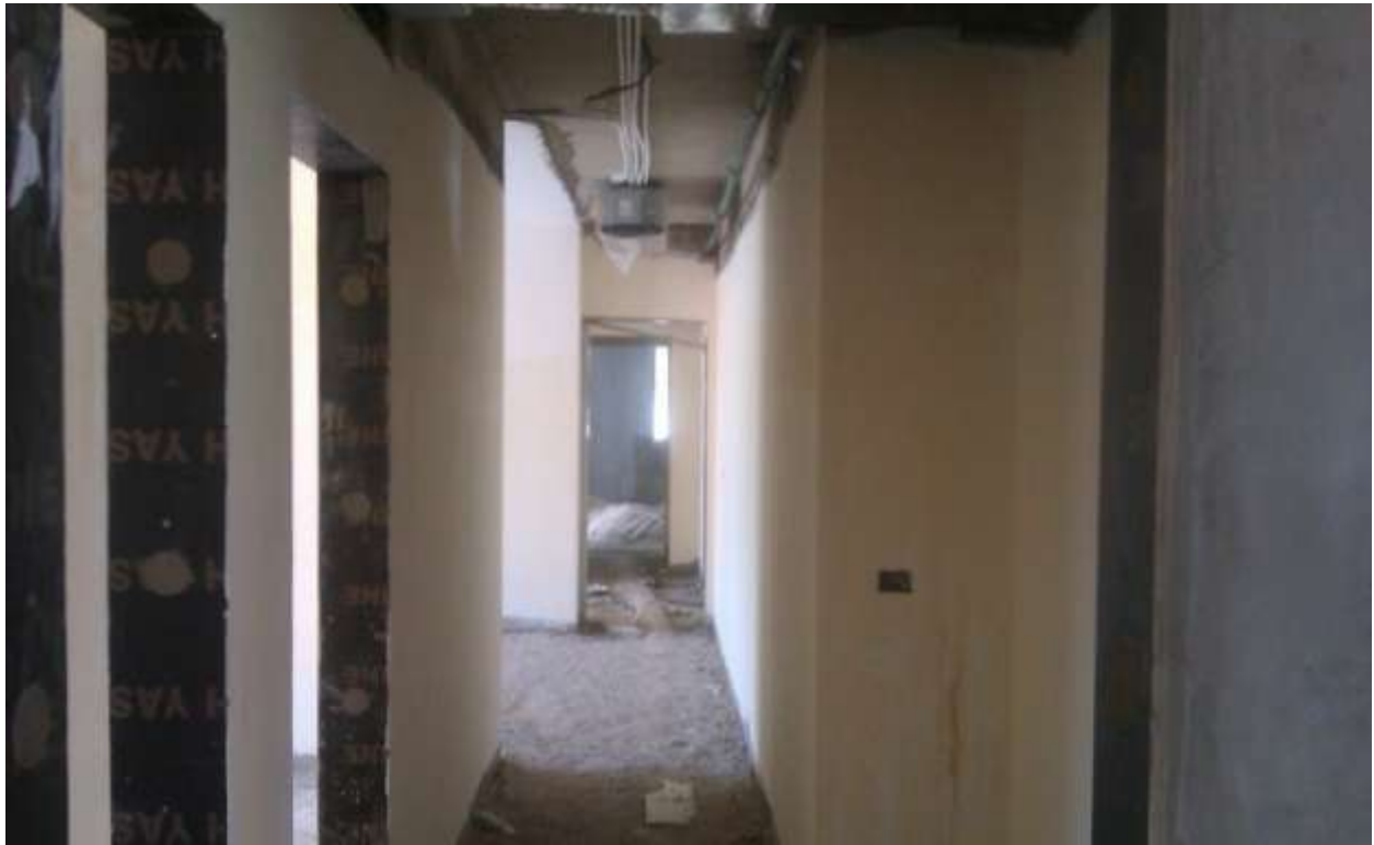
Progress of works on the 3 rd floor