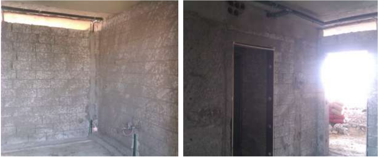
Progress of works on the 11 th floor