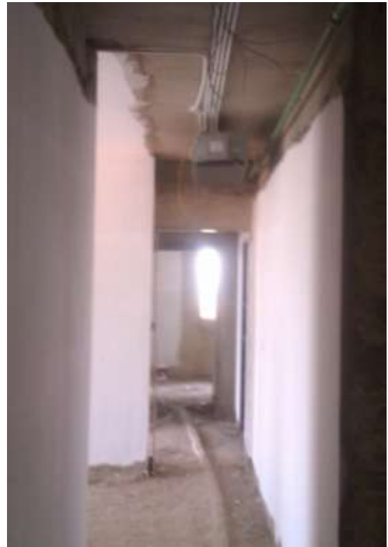
Progress of works on the 8 th floor