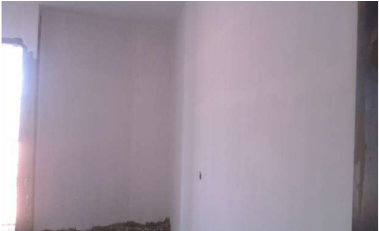
Progress of works on the 5 th floor