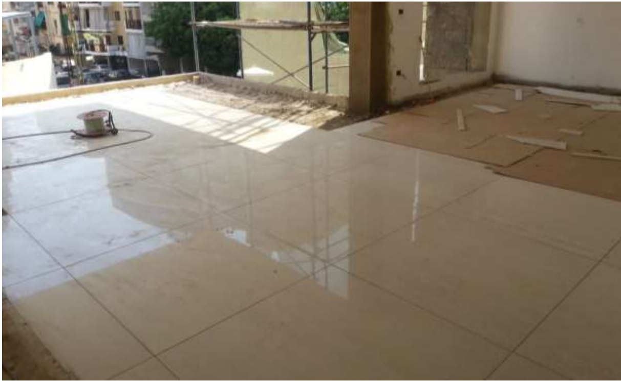
Progress of works on the 1 st floor