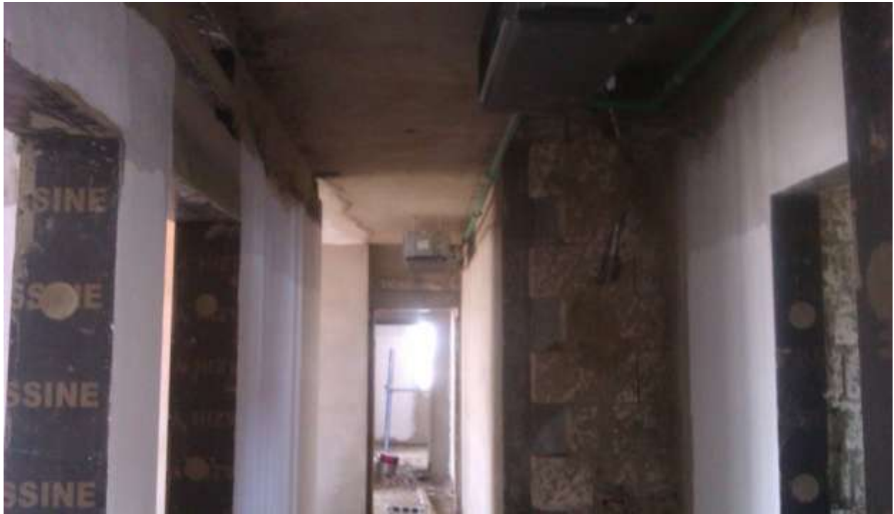
Progress of works on the 9 th floor