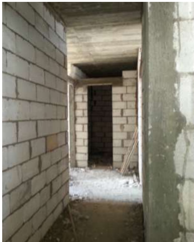
Progress of works on the 12 th floor