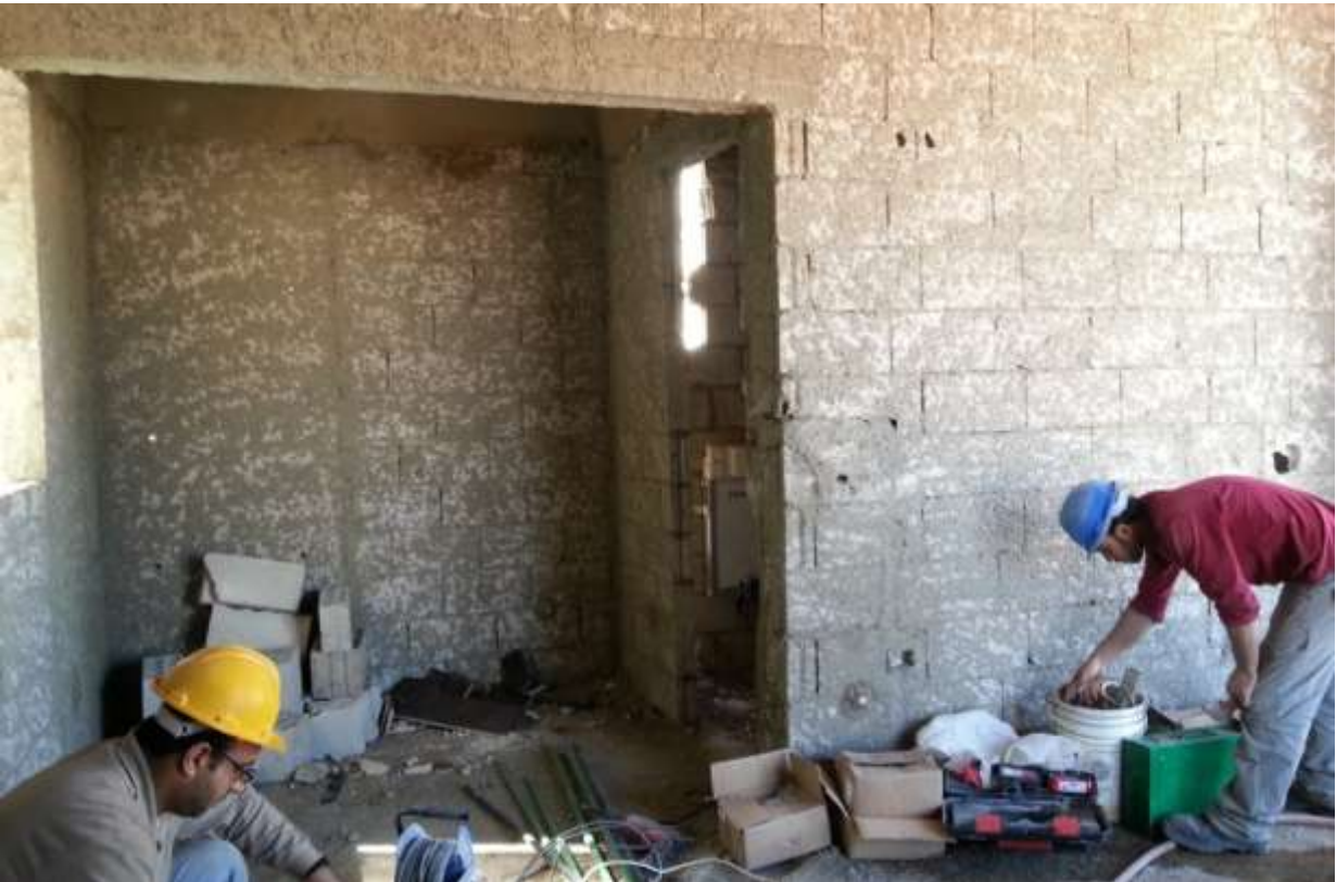
Progress of works on the 8 th floor