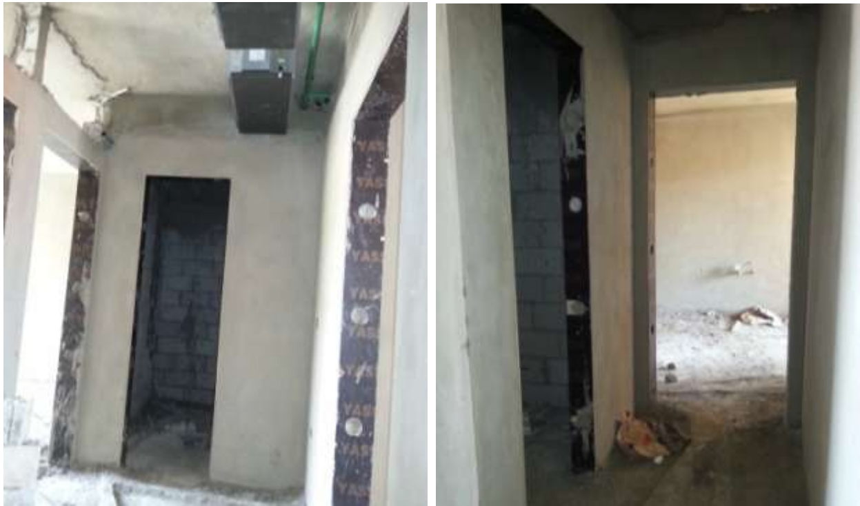
Progress of works on the 6 th floor