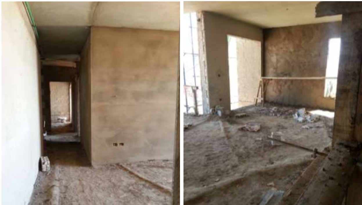
Progress of works on the 7 th floor