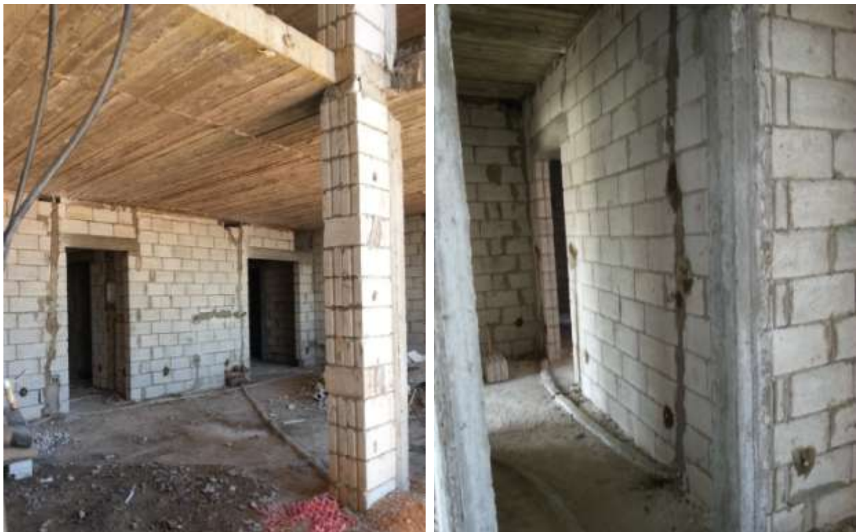
Progress of works on the 9 th floor