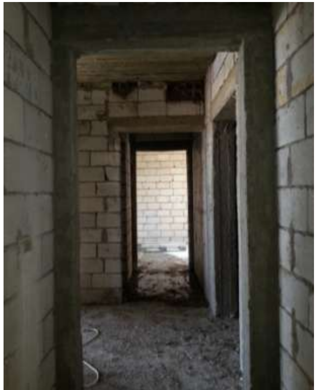
Progress of works on the 10 th floor