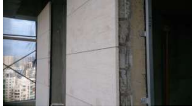
- Elevations cladding .