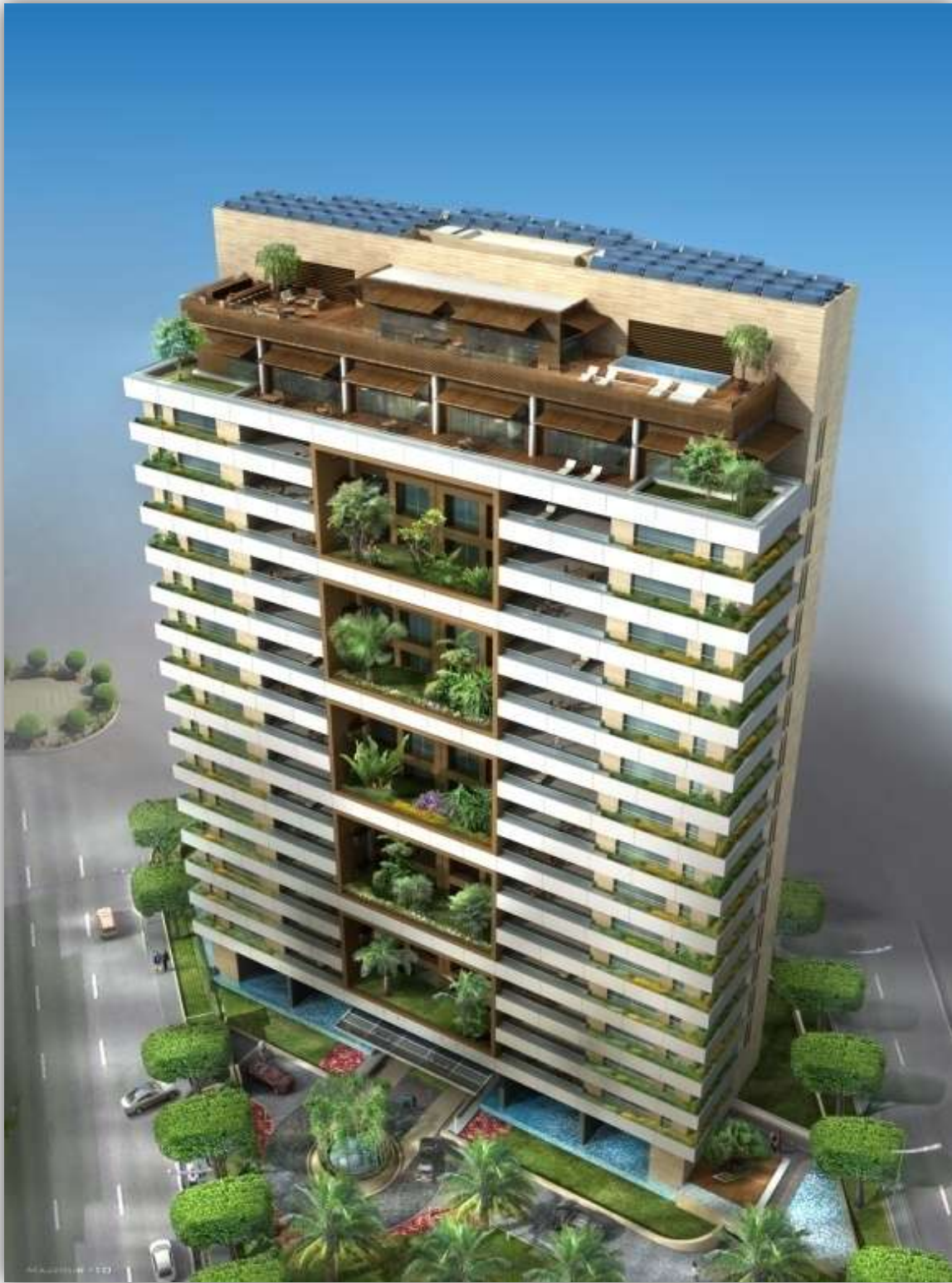
Figure 1: Exterior Perspective / Architectural Consultant: BATIMAT Architects