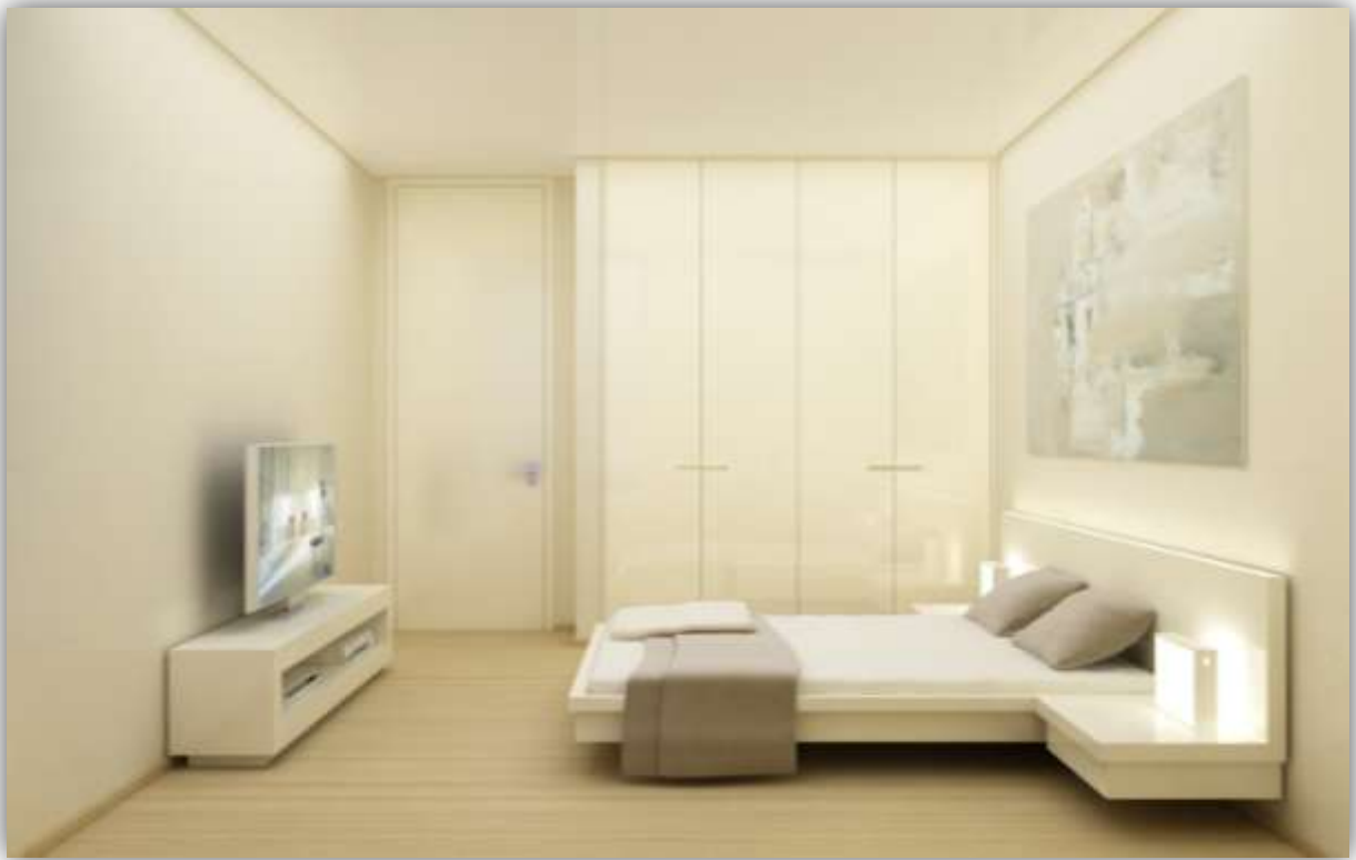
Figure 6: Apartment Interior / Interior Architect: Claude Missir Agency