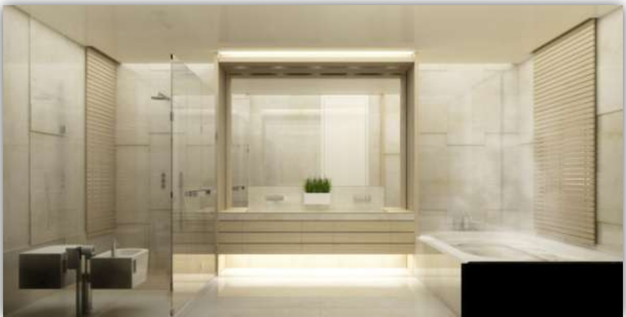
Figure 7: Apartment Interior / Interior Architect: Claude Missir Agency