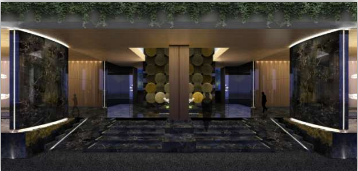
Figure 5: Entrance Lobby / Interior Architect: Claude Missir Agency