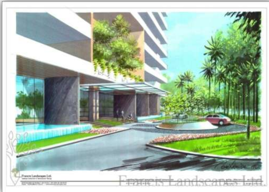
Figure 3: Landscape View / Landscape Architect: Francis Landscape