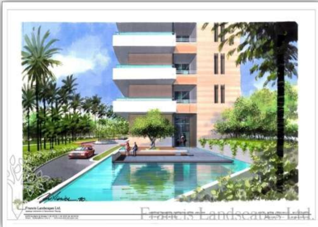
Figure 2: Landscape View / Landscape Architect: Francis Landscape