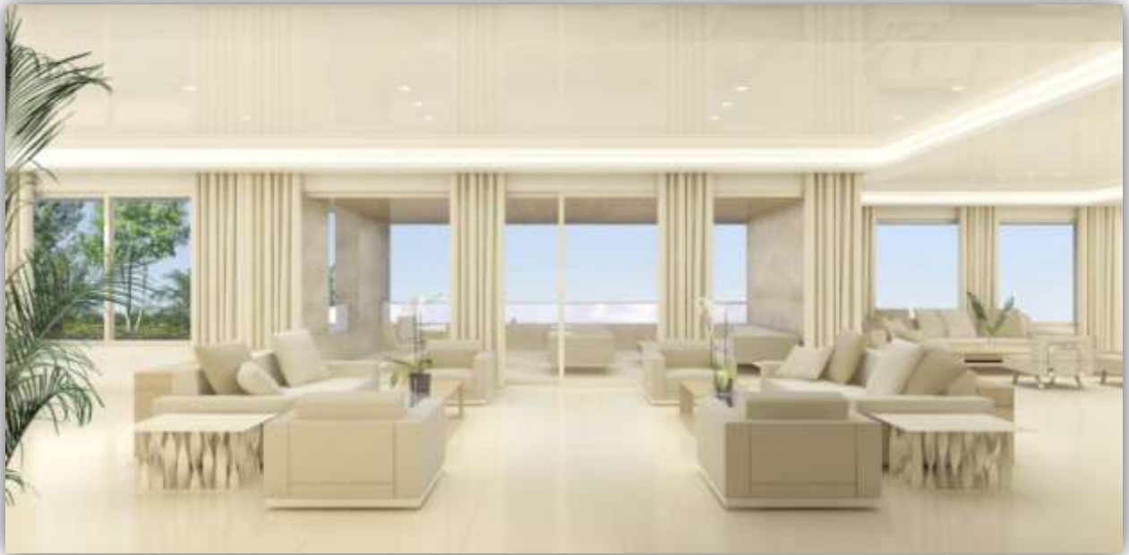
Figure 8: Apartment Interior / Interior Architect: Claude Missir Agency