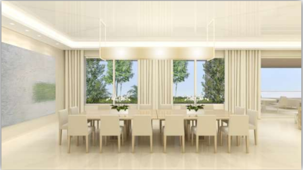
Figure 9: Apartment Interior / Interior Architect: Claude Missir Agency