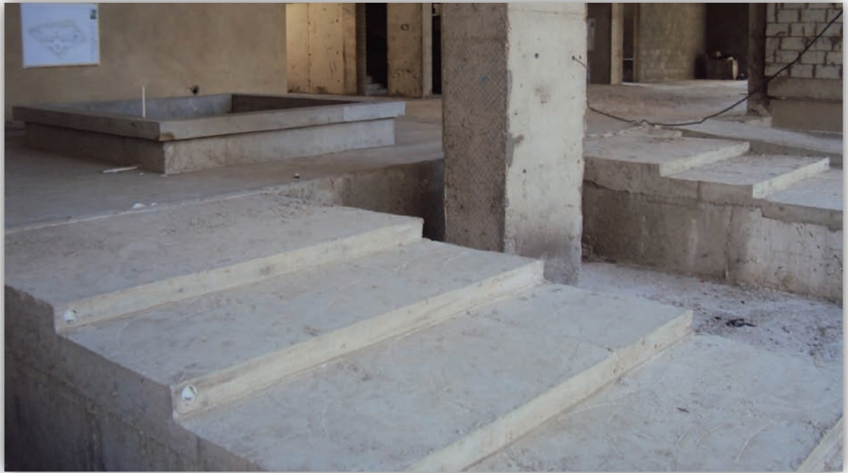
Figure 11: Main entrance stairs - June 2012