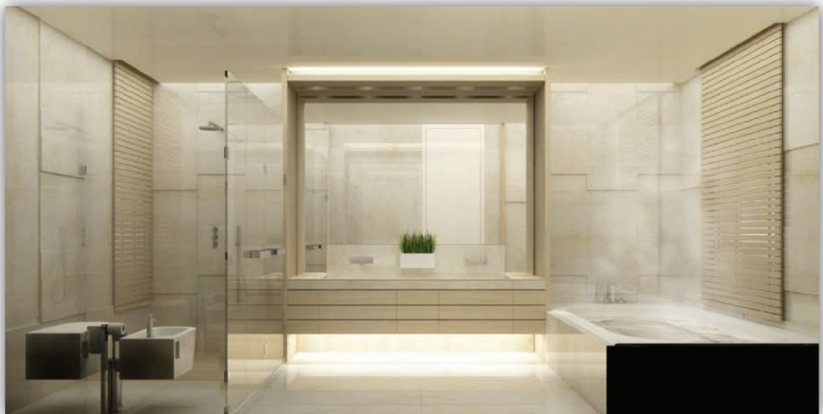
Figure 7: Apartment Interior / Interior Architect: Claude Missir Agency