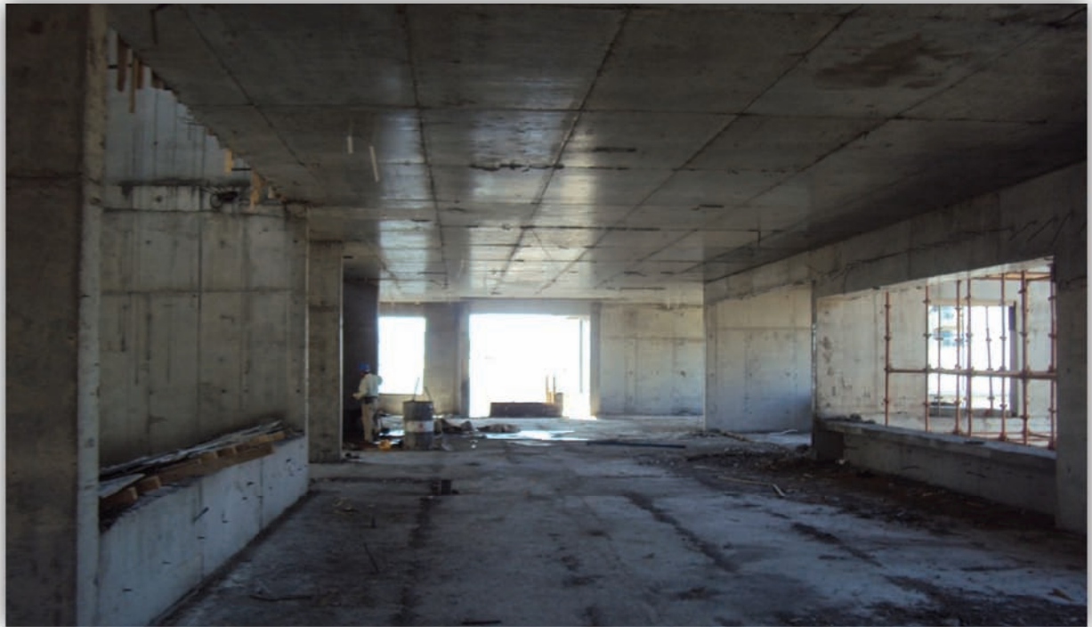
Figure 23: Concrete works @ 10th floor - June 2012