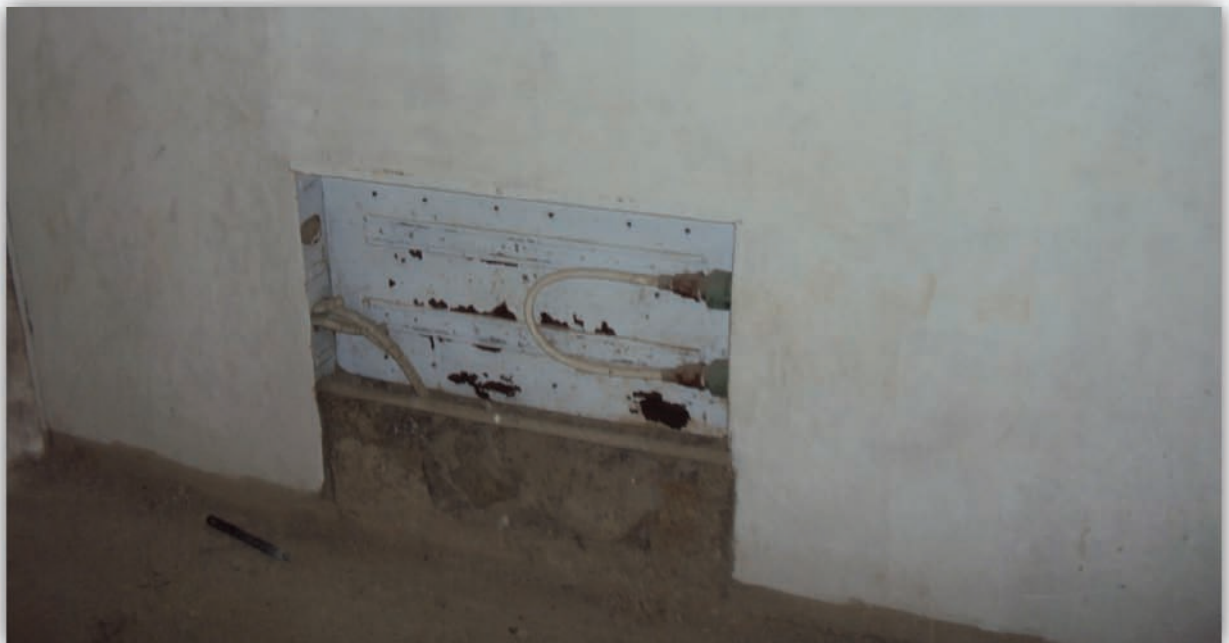
Figure 16: Manifolds for floor heating installed @ 1st floor - June 2012