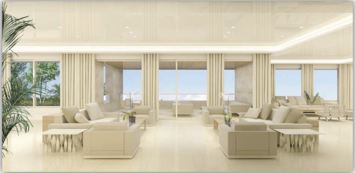
Figure 8: Apartment Interior / Interior Architect: Claude Missir Agency