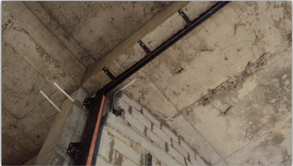
Figure 13: Main entrance / U-channels installed @ waterfountains area - June 2012