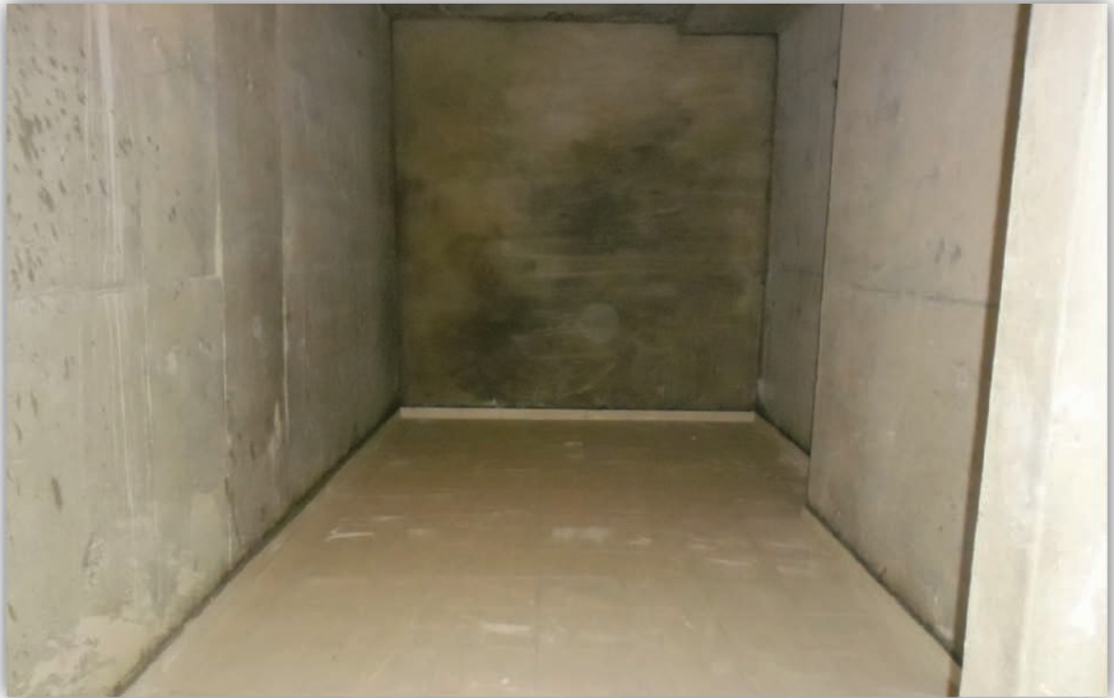
Figure 29: Tiling works @ 3rd basement - June 2012