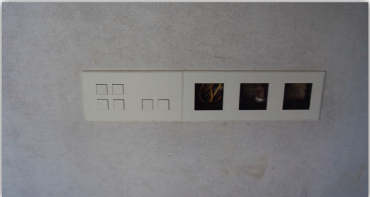
Figure 18: Wiring devices installed after plaster at 1st floor - June 2012