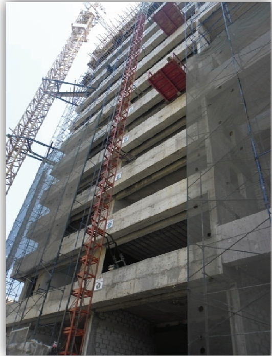
Figure 31: Exterior views – June 2012