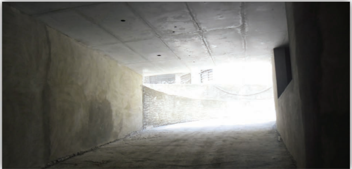
Figure 30: Ramp walls plastered, walls prepared @ ground floor ramp - June 2012