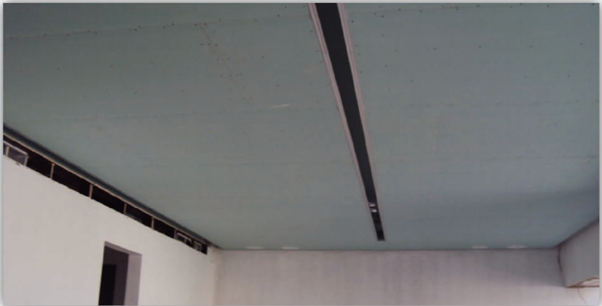
Figure 14: False ceilings works @ 1st floor - June 2012