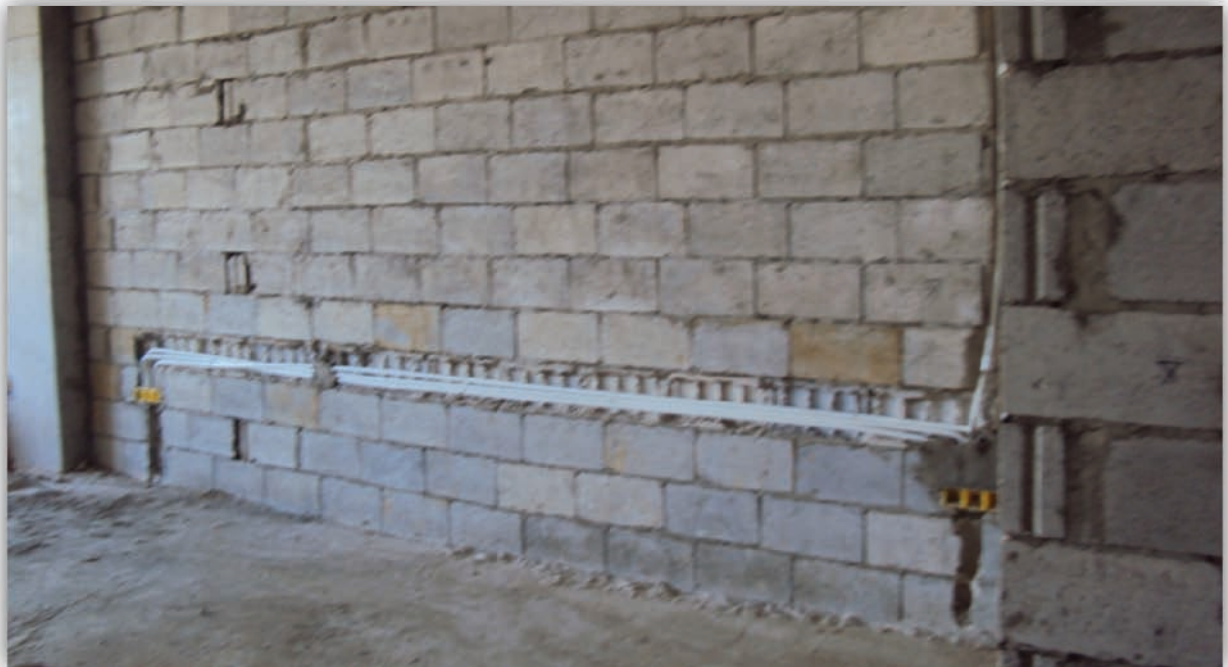
Figure 20: Electrical 1st fix @ 3rd floor - June 2012