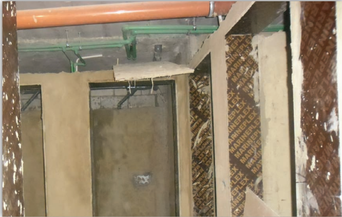
Figure 27: Subframes installed, walls plastered @ 2nd basement - June 2012