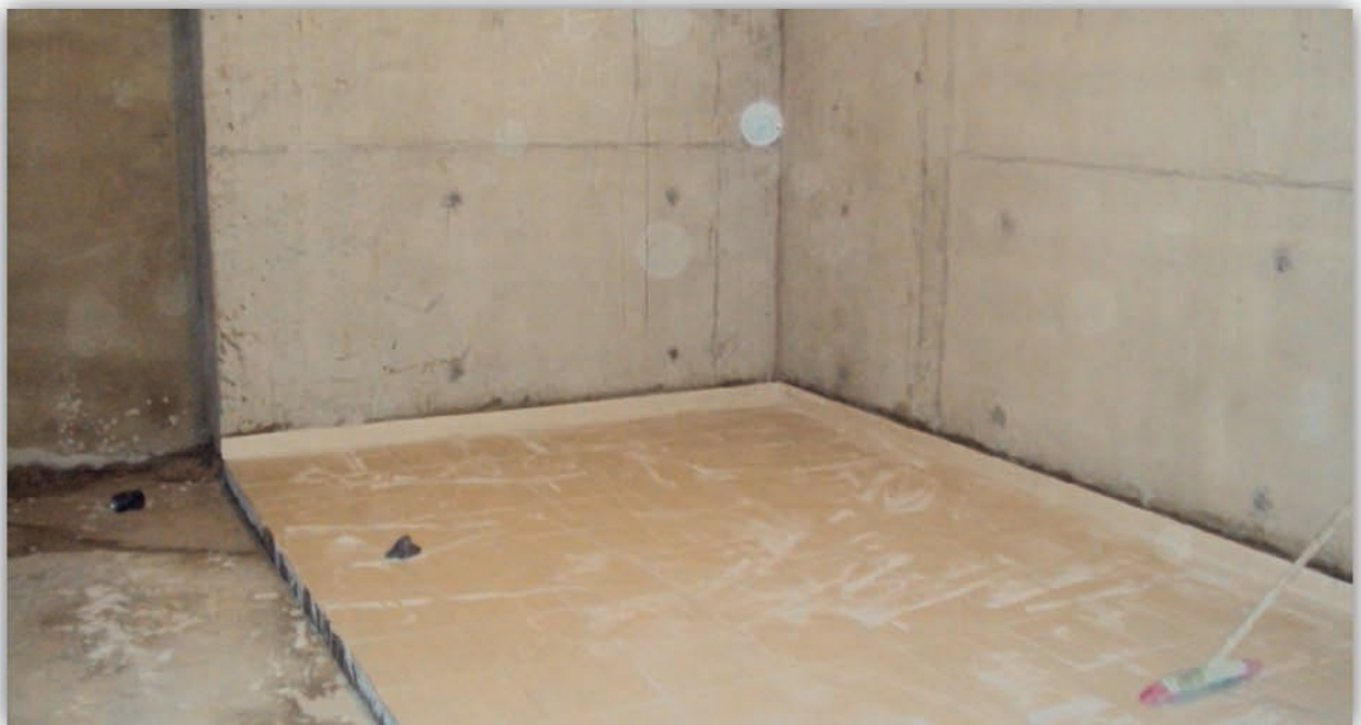
Figure 26: Tiling works @ 2nd basement - June 2012