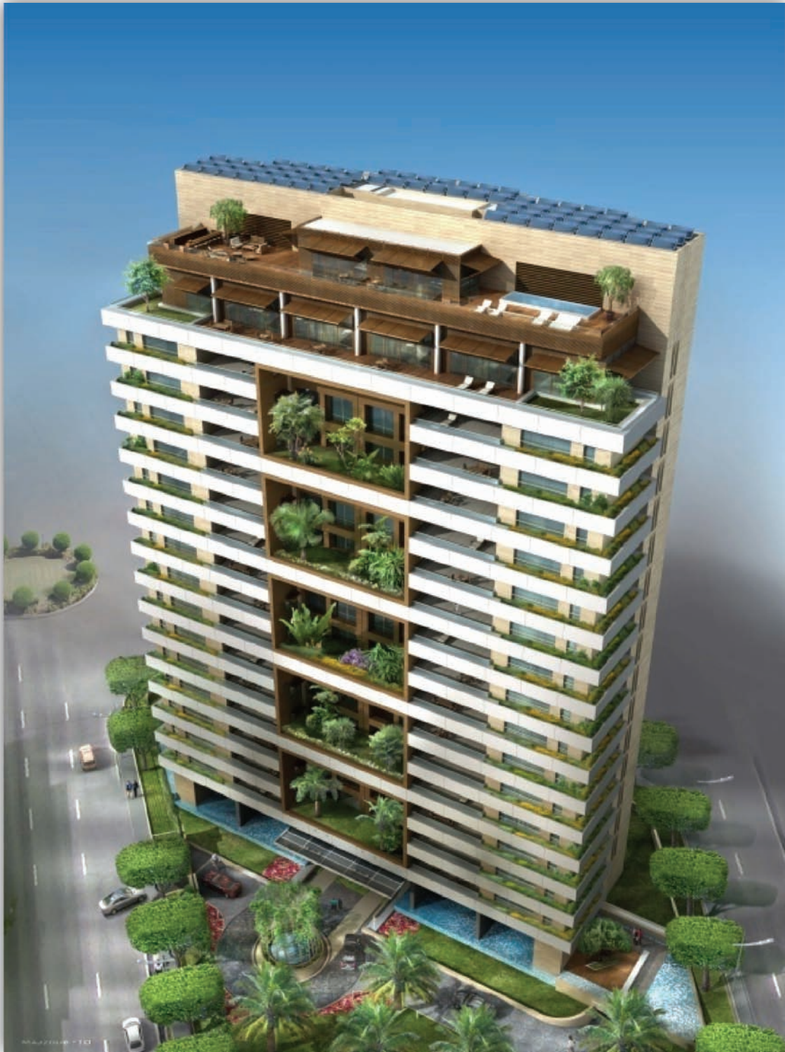
Figure 1: Exterior Perspective / Architectural Consultant: BATIMAT Architects