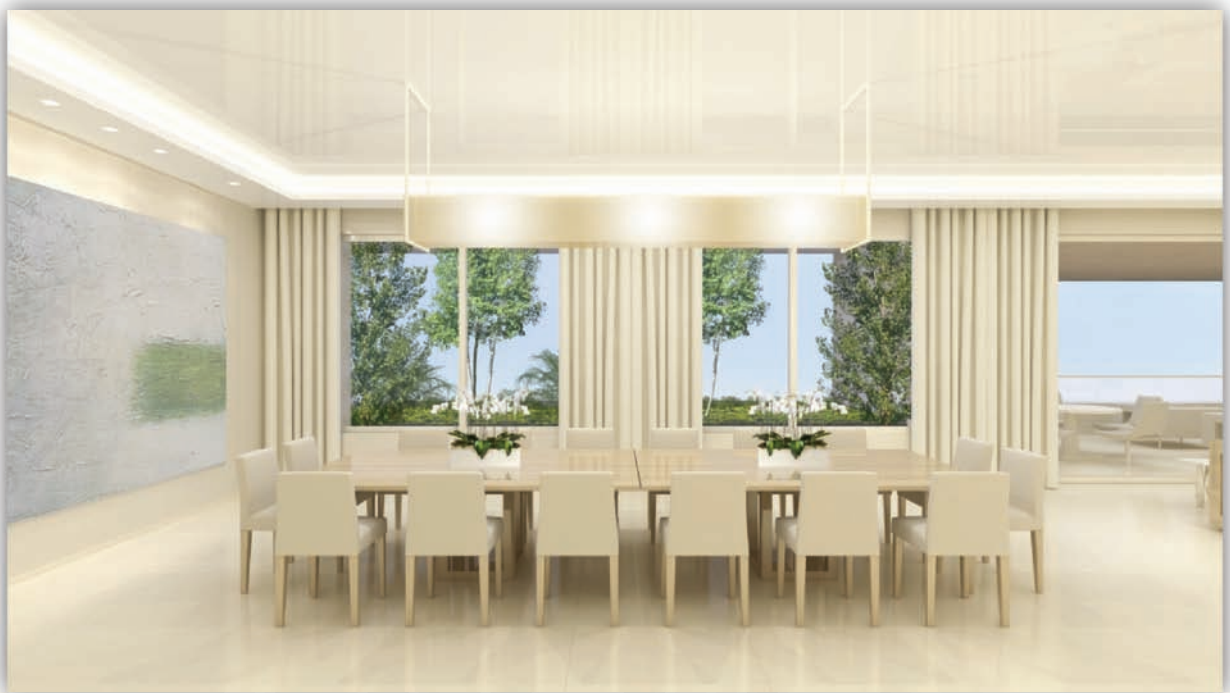
Figure 9: Apartment Interior / Interior Architect: Claude Missir Agency