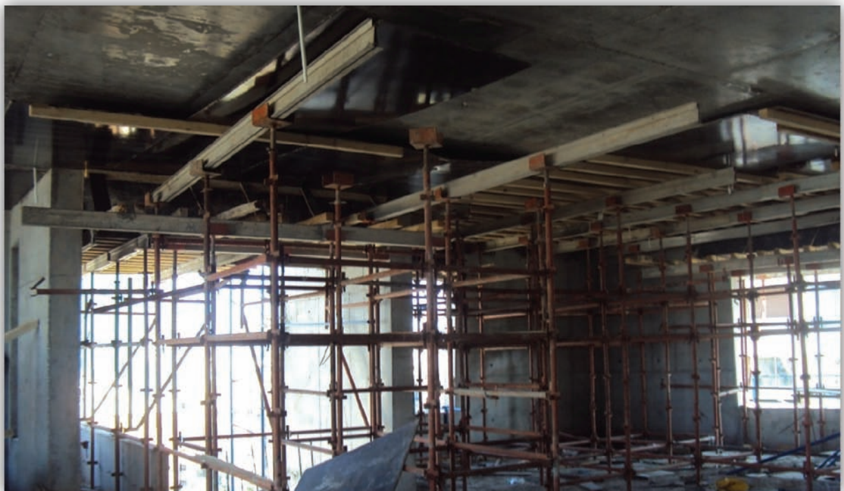
Figure 22: Concrete works @ 10th floor - June 2012