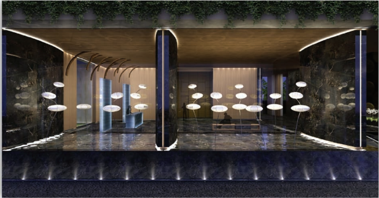
Figure 4: Entrance Lobby / Interior Architect: Claude Missir Agency