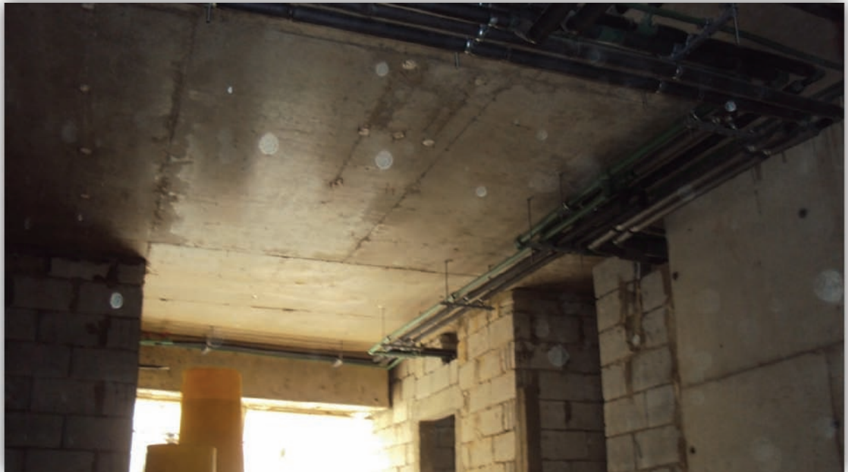
Figure 21: Blockwork and mechanical 1st fix @ 3rd floor - June 2012