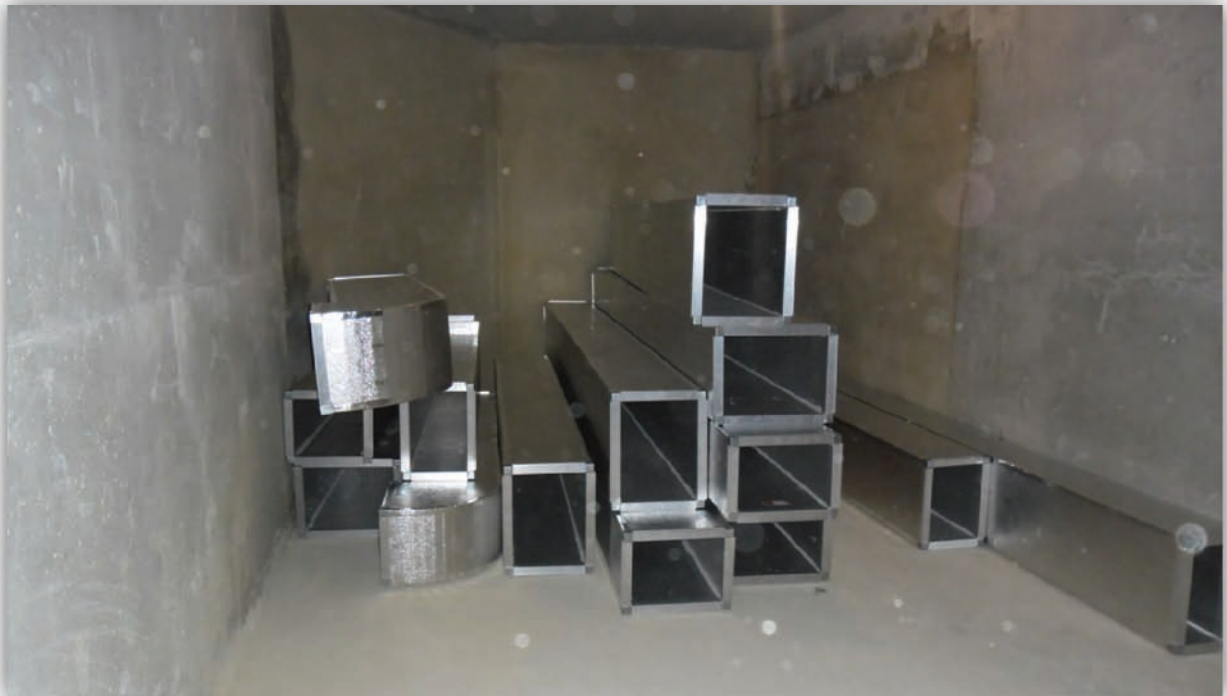
Figure 28: Ducting works @ 2nd basement - June 2012