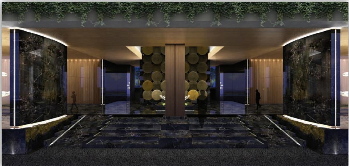
Figure 5: Entrance Lobby / Interior Architect: Claude Missir Agency