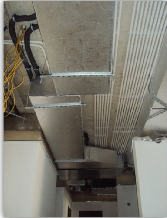
Figure 19: Mechanical and electrical installations @ 1 st floor – June 2012