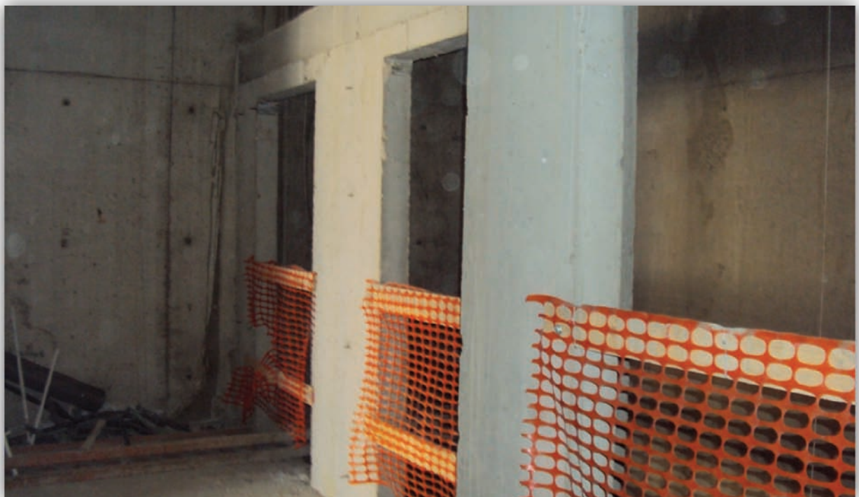
Figure 24: Concrete works of elevators walls @ ground floor - June 2012