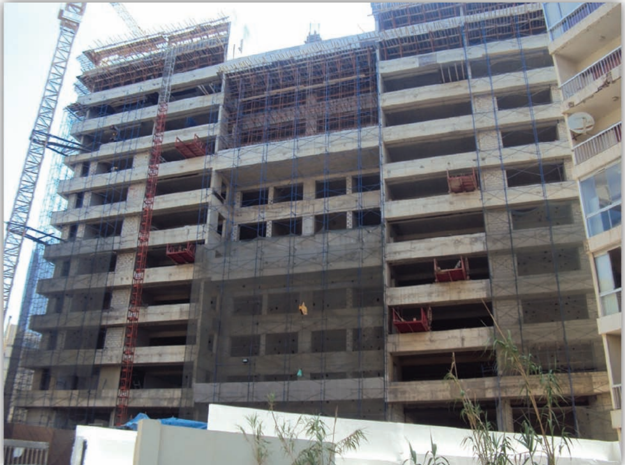
Figure 10: Main elevation - June 2012

They are not necessarily demonstrating all activities of works that were carried out during the period of the report.