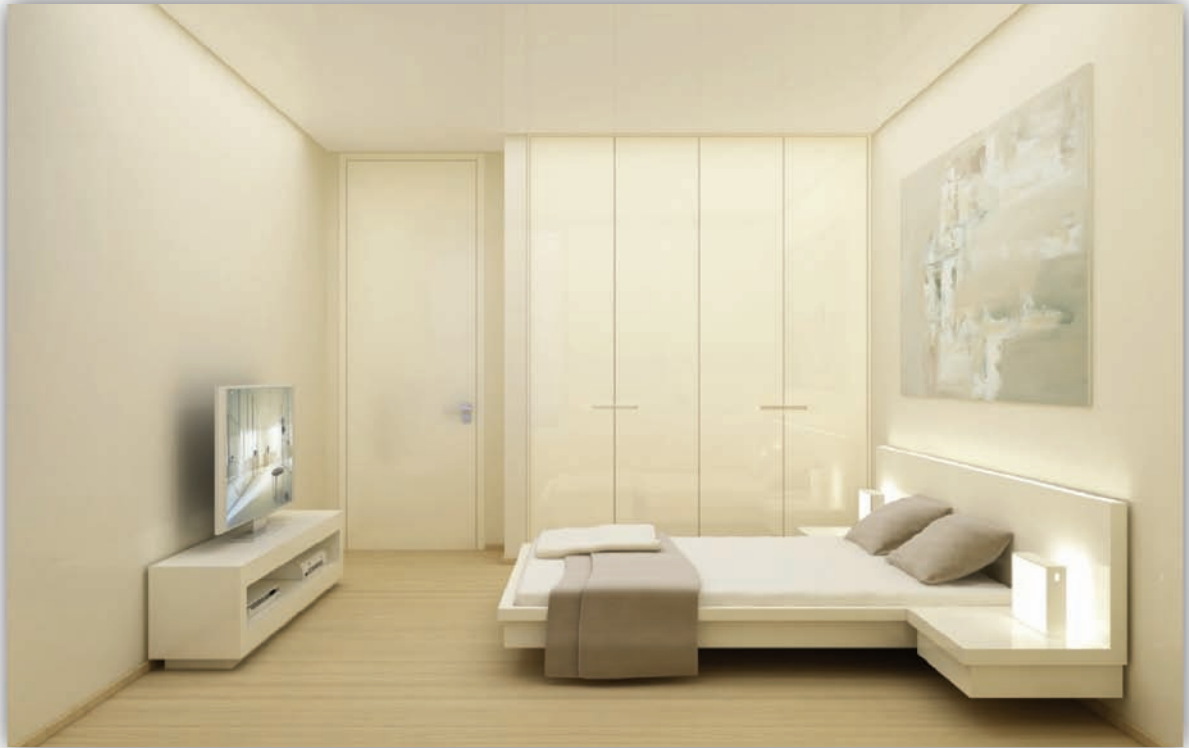
Figure 6: Apartment Interior / Interior Architect: Claude Missir Agency