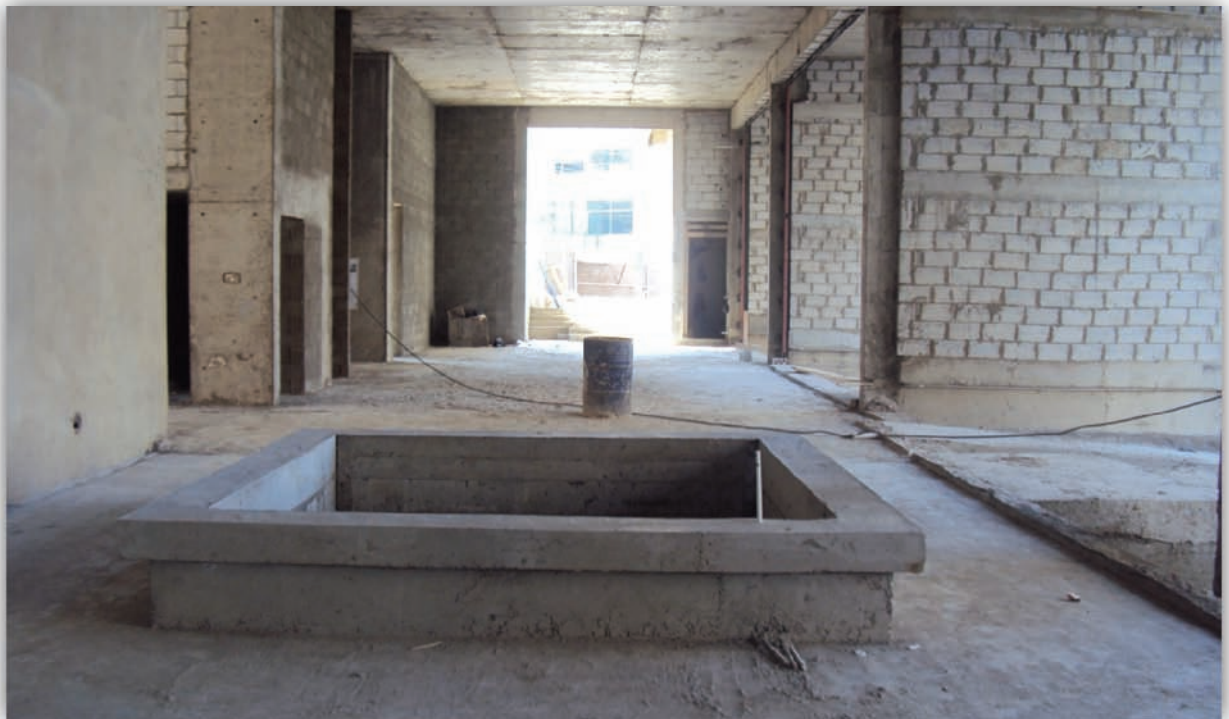
Figure 12: Main entrance / planter - June 2012