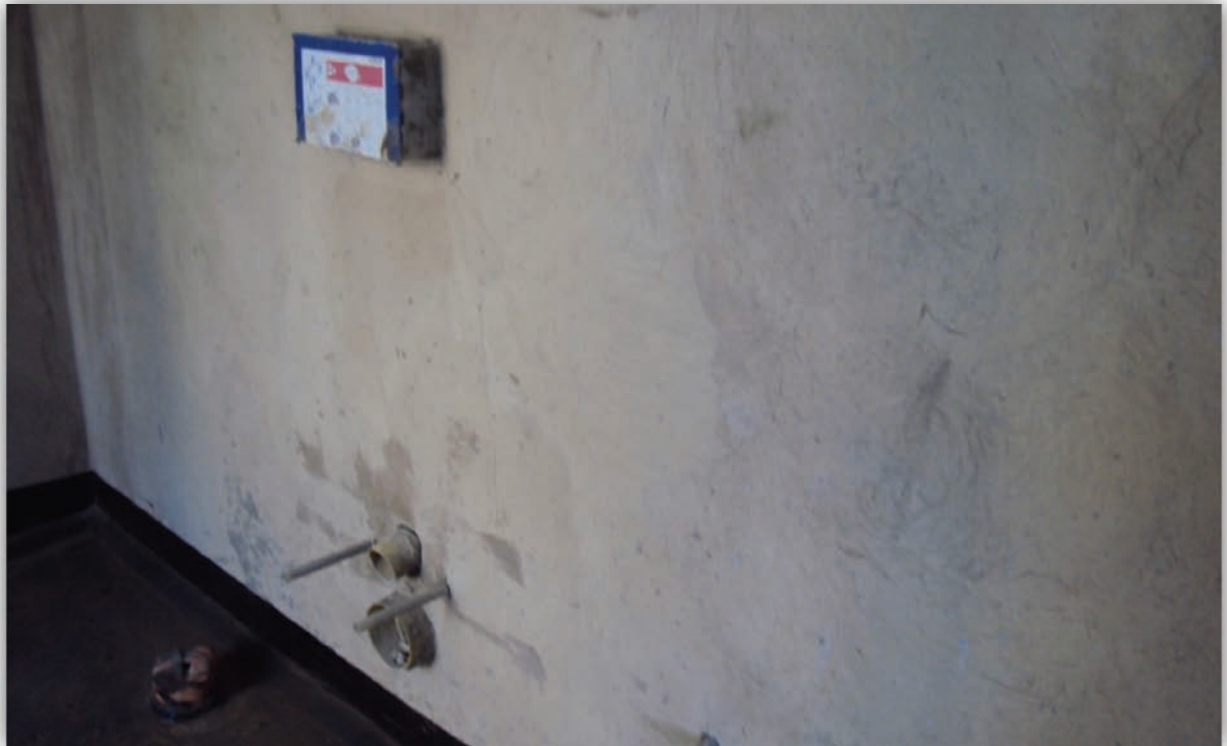
Figure 17: Built-in sanitary items installed, bathrooms plastered and waterproofed @ 1st floor - June 2012