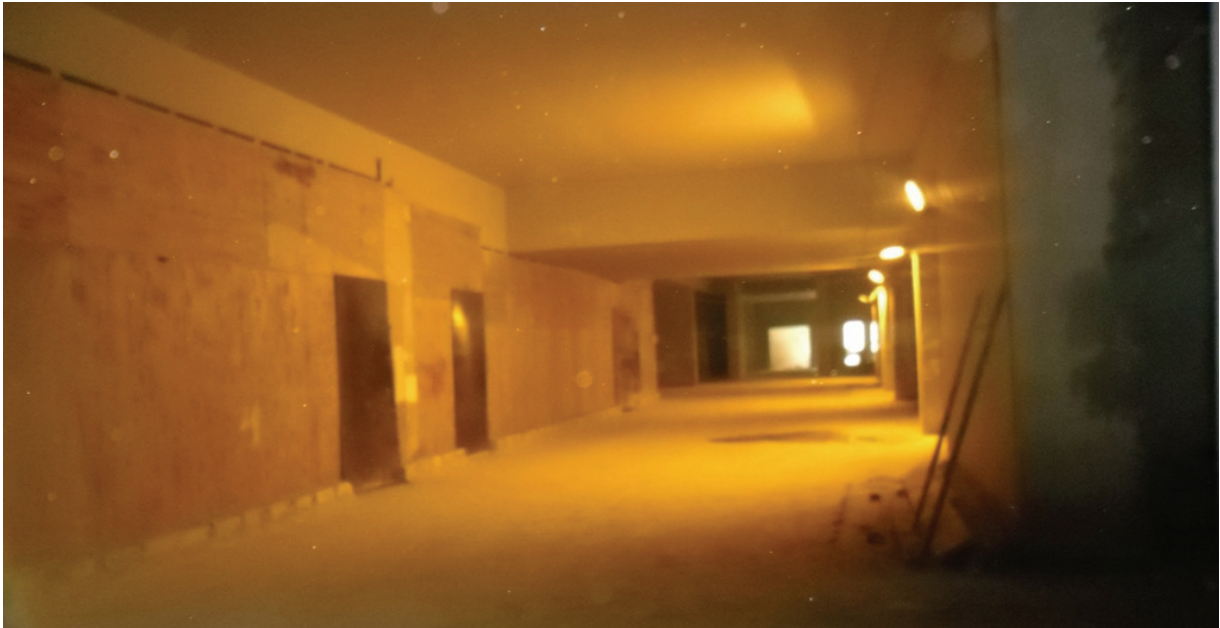
Figure 25: Plaster, floor and ceiling preparation @ 1st basement - June 2012