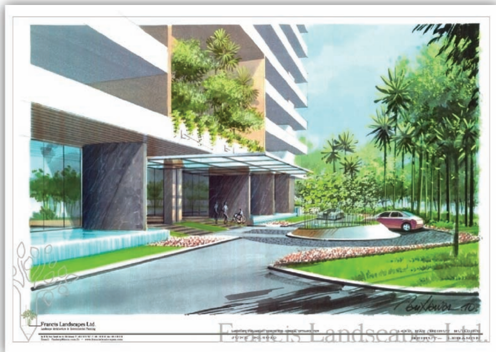
Figure 3: Landscape View / Landscape Architect: Francis Landscape