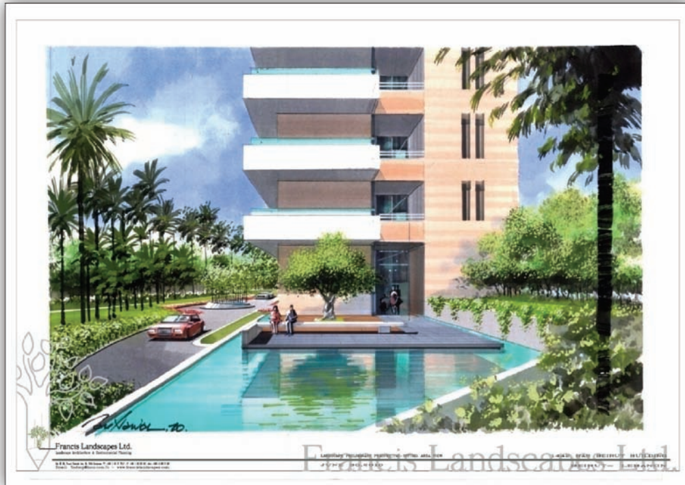
Figure 2: Landscape View / Landscape Architect: Francis Landscape