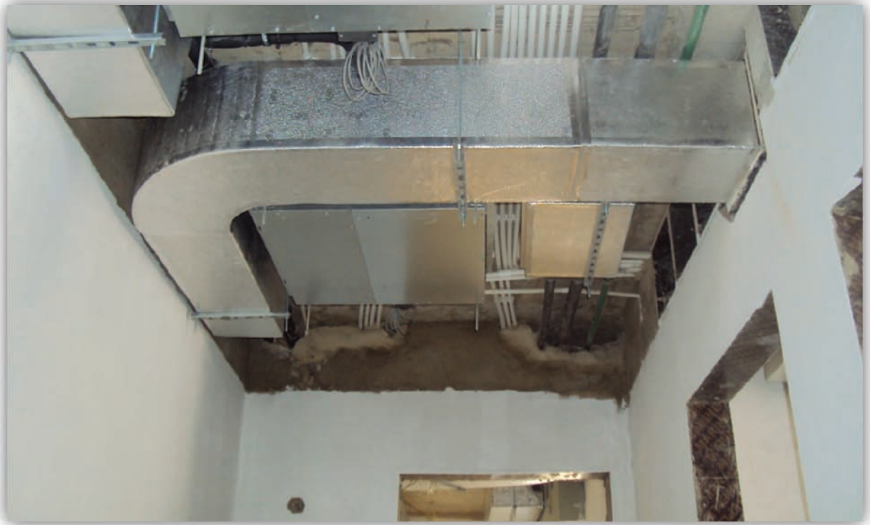
Figure 15: Ducts and indoor units installed @ 1st floor - June 2012